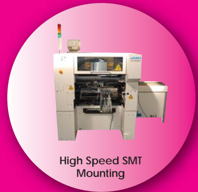
High Speed SMT Mounting